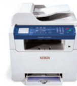
print | copy | scan | fax