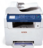
print | copy | scan

Call today. For more information, call 1-877-362-6567 or visit us at www.xerox.com/office